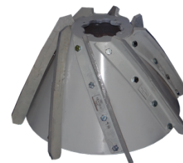
Tungsten Carbide Flites (Set of 8)

Hard-Chrome is Applied to Increase the Time Required Between Changes and Ensures a Precision Fit Each Time.