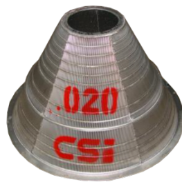
0.020" (500 micron) Profile Wire Screen

Balances Centrate Fines and Discharge Dryness. Good Starter Screen for Average to Large Cuttings.