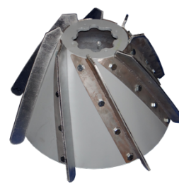
Individual Hard Chrome Flites (Set of 8)

Balances Centrate Fines and Discharge Dryness. Best Starter Screen for Average to Large Cuttings.