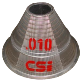
0.010" (250 micron) Profile Wire Screen

Need a complete turn-key waste cuttings management system? Elgin has the perfect solution for today's operational needs.