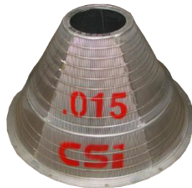
0.015" (400 micron) Profile Wire Screen

Minimizes Centrate Fines, But Lowers Solids Discharge Dryness. Best Utilized for Fine Cuttings.