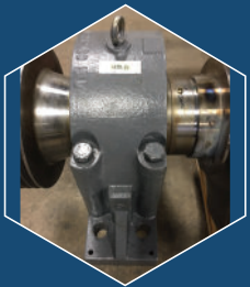
Heavy-Duty Pillow Blocks with Premium Bearings