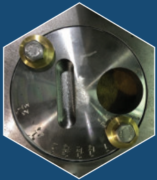
Four Stainless Epicentric Liquid-End Discharge Ports