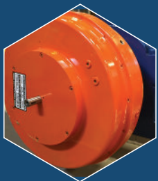
SA-69 Gear Box with 80:1 or 140:1 Ratio