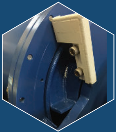
Four Wide-Mouth Solids-End Discharge Ports