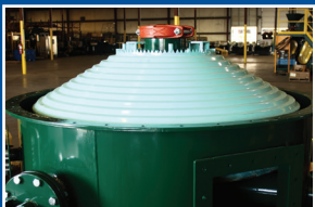
High-grade fiberglass ribbed plates for maximum degassing efficiency.