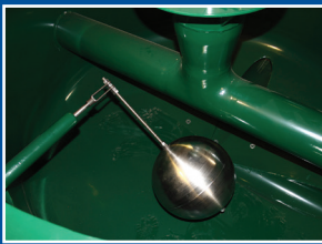
Stainless-Steel float withstands harshest of chemicals.