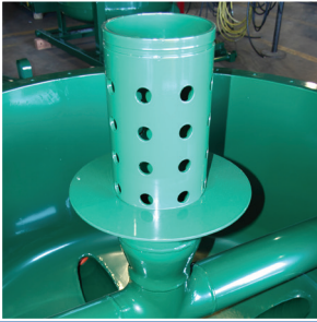
Perforated fluid inlet pipe for equal distribution of fluid across weirs.