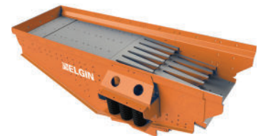
Tabor™ Grizzly Feeder