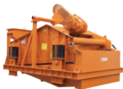
Tabor™ Reverse Incline

Elgin has a full range of vibrating screens and feeders capable of maximizing your operations.